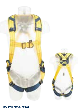
DELTA<sup>TM</sup> Front & rear fall arrest attachment points. Pass-thru buckles. Comfort padding.