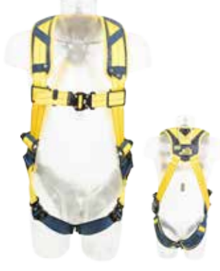
DELTA<sup>TM</sup> Rear fall arrest attachment point. Quick-connect buckles. Comfort padding.